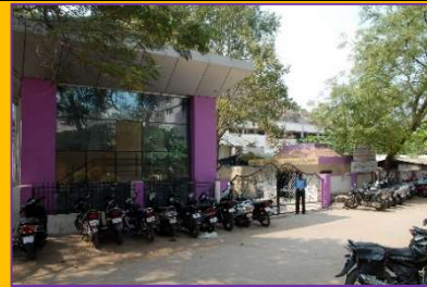
Bellary Private Industrial Training Institute, Ballari (Estd. 2006) ITI – Fitter & Electrician