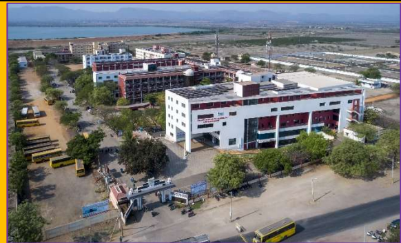
Ballari Institute of Technology & Management, Ballari (Estd. 1997) BE, M.Tech., MBA & Research Centre