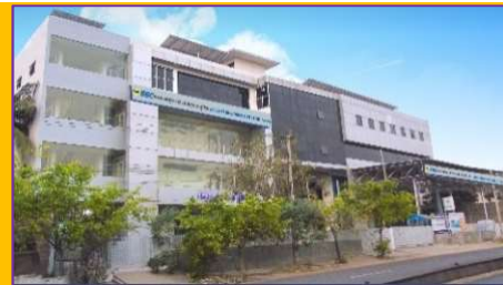
Ballari Business College, Ballari (Estd. 2012) BBA & B.Com (Gen. & TPP)