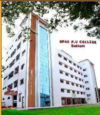
BPSC Pre University College, Ballari (Estd. 2012) Science & Commerce