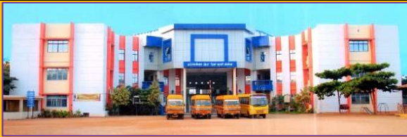
BPSC Kids Academy, Ballari Play School to UKG Basavarajeswari Public School & College, Ballari (Estd. 2006) ICSE 1st- 10 th Std