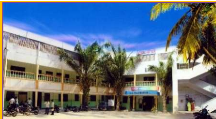
Sanjay Gandhi Polytechnic, Ballari (Estd. 1992) 3 Years Diploma Courses